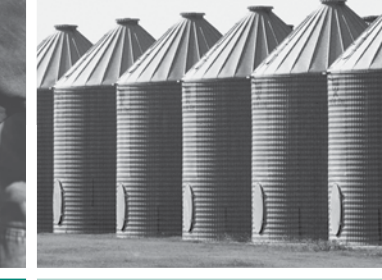
SUMMARY OF RESULTS